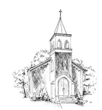
St. Stanislaus, Chatsworth Sunday 9:00 am