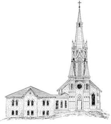
St. Mary of the Assumption Owen Sound

Email: smm@bmts.com www.stmarysandthemissions.ca